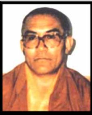
Chadrel Rinpoche, former Abbot of Tashi Lhunpo

This is an appeal to: • Highcommissioner for Human Rights UN • United Nations Special Rapporteur on Religion and Belief • Minister of Justice of People's Republic of China • Chinese Embassy in Germany, Austria and to the UN • Director of Tibet Justice Department • Prime Minister of PRC Wen Jiabao