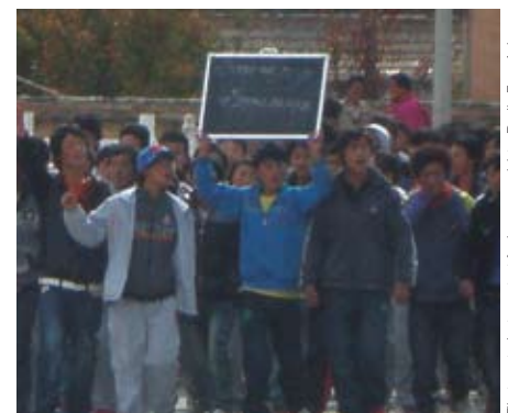
Tibetan students protest for language rights.

Reality: “...there are few lucrative job prospects for Tibetans who have not