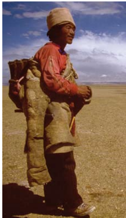
Nomad on the grasslands of Tibet.

China says: 'Life expectancy of Tibetans is 67 years, almost double the 35.5 years prior to the liberation of Tibet. Between 2006 and 2010 1.7 billion yuan was spent to finance free medical services for Tibetan farmers and herders' (15a).