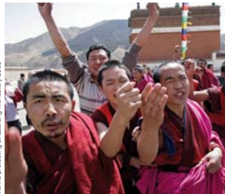
Monks protesting at Labrang Monastery 2008

Reality: Since China’s occupation, Tibetan Buddhism has been under attack to undermine the core belief system at its heart and sever loyalty to the Dalai Lama. An estimated 6,000 monasteries were destroyed and today the number of monks and nuns are vastly reduced, religious institutions tightly controlled and ‘patriotic re-education’ campaigns regularly carried out (9b). In April 2011